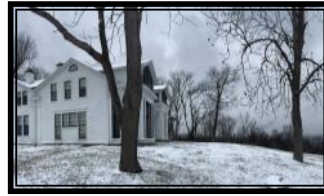
Veraestau Historic Site 4696 Veraestau Lane

Contact Rumpke at 800-828-8171 today to order delivery of new 96 Gallon trash tote for trash pick-up. $3.00 per month per trash tote applies.