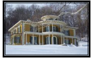
Hillforest Victorian House Museum 213 Fifth Street